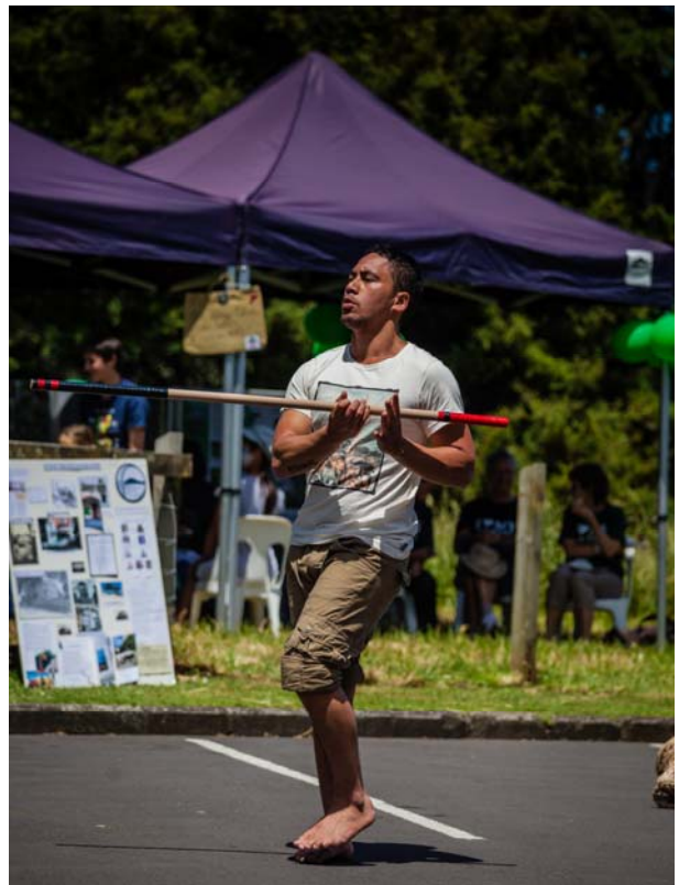
Mau rākau display (CTA static display in background)