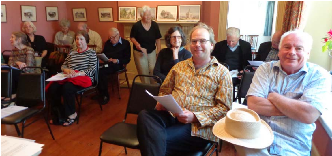
Attendees at the AGM