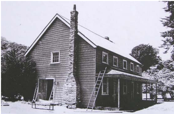
Undergoing restoration in the early 1970s