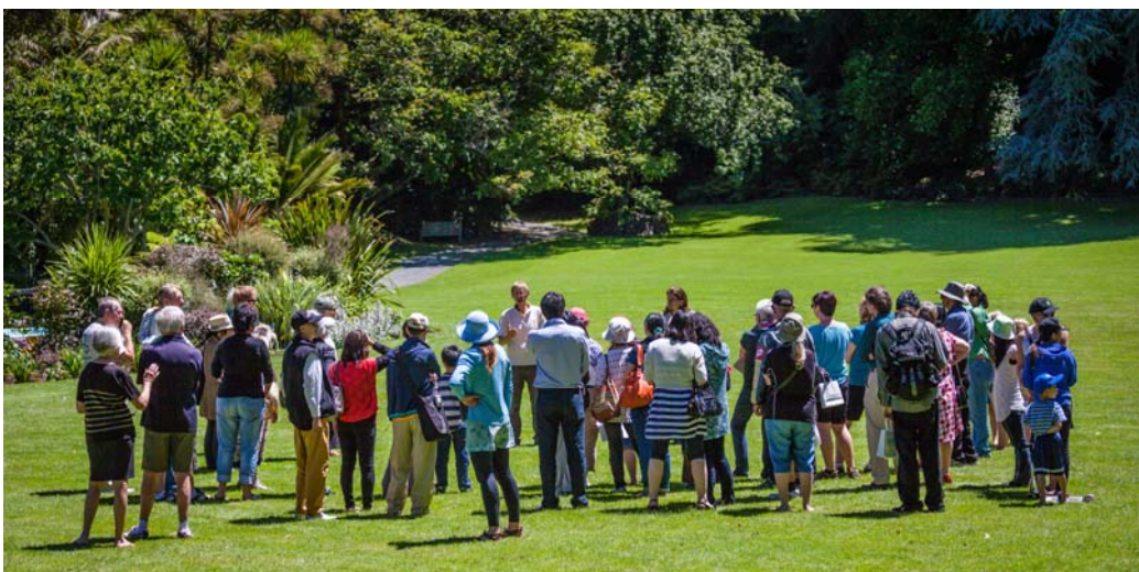
Government House garden tour