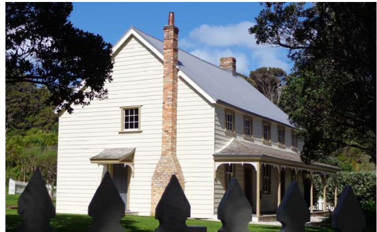
As at 13 October 2012