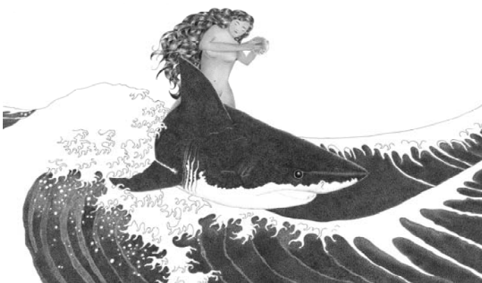
Shark Rider - Rio Rossellini