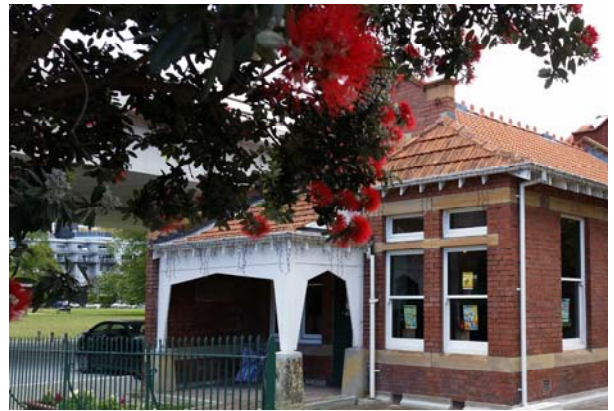
Pohutukawa & Logan Campbell Kindergarten photo - Freestyle Event Photography

While pohutukawa are currently gracing many parts of our city with their beautiful Christmas blooms, Auckland Transport wants to remove six 80-year-old pohutukawa from Great North Road so that more lanes can be added to the main highway.