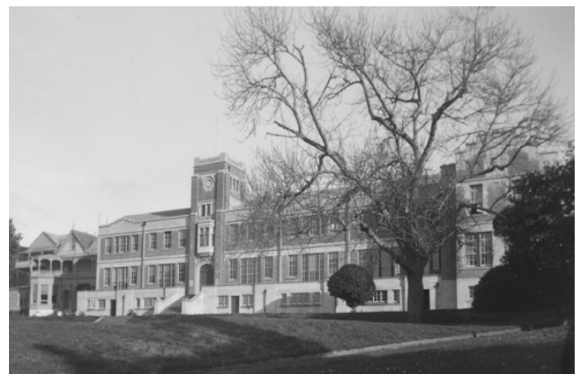
Hanna Block - George Grey Collection, Auckland Library

"We would encourage those making the decision to revisit it and explore whether they can meet their needs without destroying their heritage."