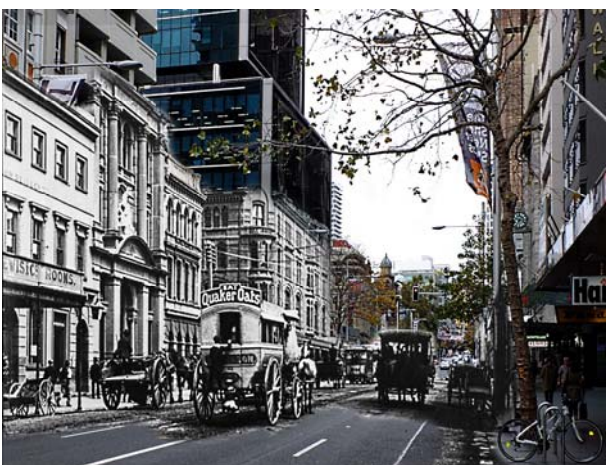
Lower Queen St 1898 (4-1399)