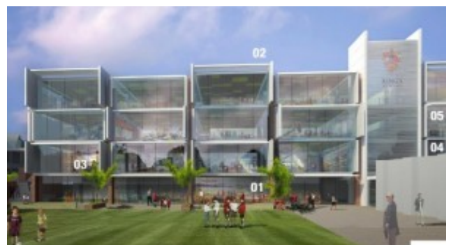
The proposed Centennial Building