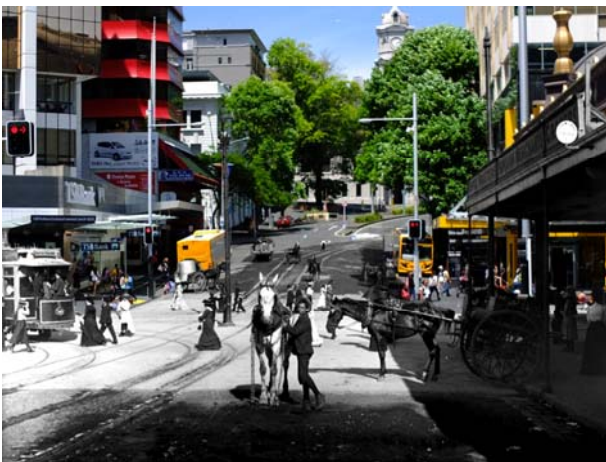
Queen & Wellesley St BW merge, Feb 1903 (1-W1051)

More details will be in the festival programme and also in an email closer to the date.