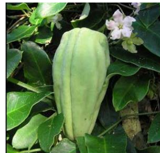
Moth plant

CTA newsletters from 2010 onwards are available at www.civictrustauckland.org.nz