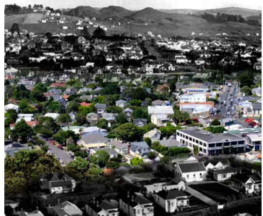
Images by Mark Bishop. Black and white photographs from Sir George Grey Special Collections, Auckland Libraries