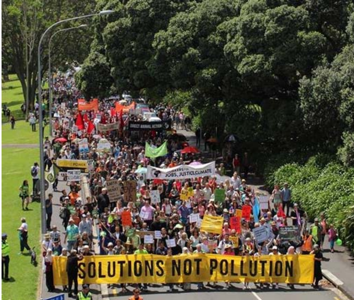
Auckland Climate Change march in Bowen Ave

It was good to see a number of CTA members on the 15,000 strong Auckland march on the morning of 28 November, which went from Albert Park to Myers Park.