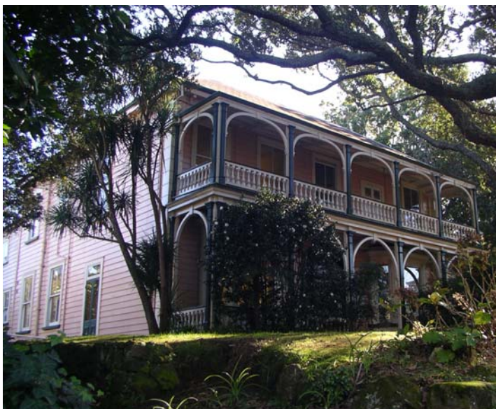
Hamurana