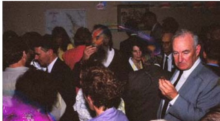
Hamurana social gathering