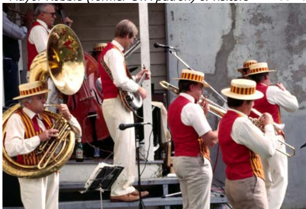
The Lex Pistols