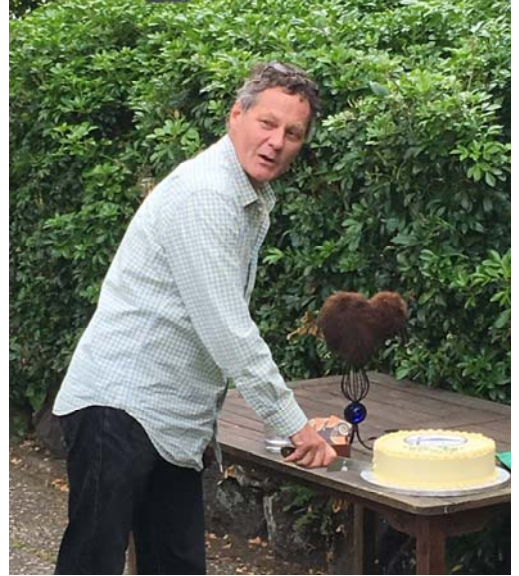
The president cuts the cake