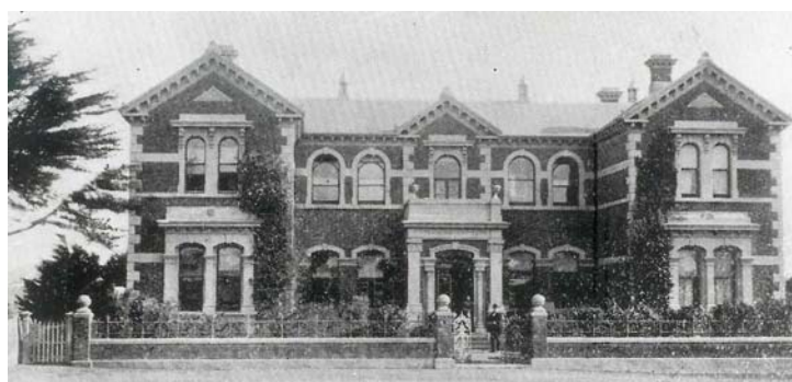
Carlile House

Heritage sites often struggle with funding constraints for maintenance. There have been solutions to save them from the wrecking ball, but it often involves individual philanthropy or government intervention by means of tax rebates or acquisition. Struggling heritage sites are often privatised, which often result negatively in regards to its cultural significance. This research aims to promote the role of private corporations in the maintenance of heritage sites by incorporating "Corporate Social Responsibility" (CSR). Several case studies are raised and the effectiveness of bridging partnership between private corporation and heritage sites through this approach is discussed.