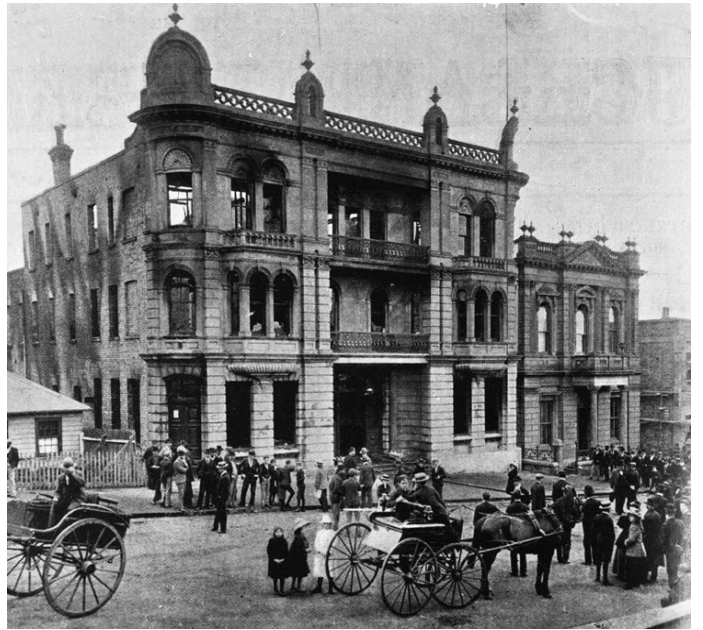
The Grand Hotel after the fire