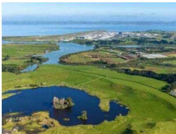
Crater Hill, Papatoetoe

See https://civictrustauckland.org.nz/crater-hill-volcano-saved-from-housing-developments/