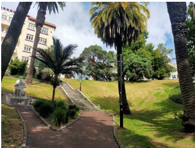
Myers Park by Espano