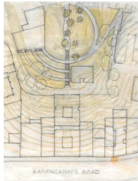
Concept for amphitheatre