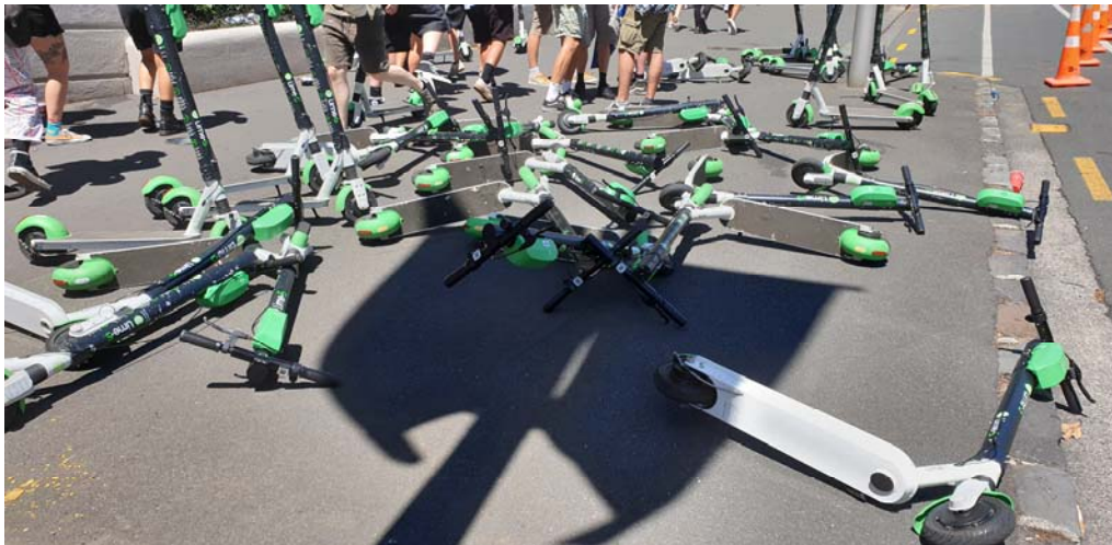
Scooters “parked” on Wellesley Street

(g) CTA submitted on NZTA’s recent Consultation on Lane Use Improvements to support Proposal 3 to “Allow people to ride e-scooters in cycle lanes.” We went further to submit that where a cycle lane has been provided, e-scooters must be ridden in the cycle lane. Walking down Queen Street, High Street or any street in Auckland in the city centre, or in the suburbs where there is a high density of pedestrians, e-scooters pose a danger to people on foot, especially those with hearing, sight, or mobility issues. Being passed closely by a scooter is a distressing experience for a pedestrian, and already many people have been injured by e-scooters. Nationally, between 2021 and 2023, there were over 7,000 ACC claims for e-scooter related injuries, with a 37% increase in 2023. There have been several deaths from e-scooters in Auckland and many serious head injuries.