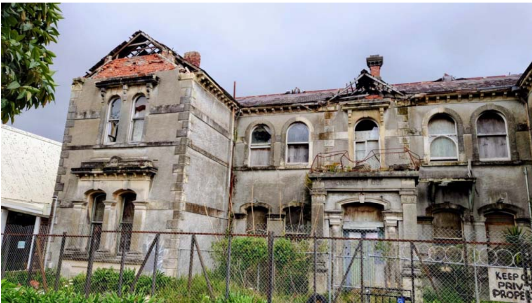
Carlile House 2026