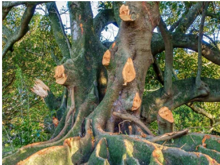
Tree on Mt Richmond/Ōtāhuhu

protect their trees. While these groups have had to fundraise to enable them to be represented in court, the TMA is funded by Auckland Council to respond to these members of the public. We request that Council cease funding these court cases.