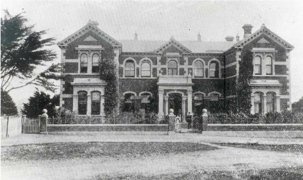
Carlile House, c 1886

details/9584/Costley%20Training%20Institute%20(Former) building from reaching an irreversible state of disrepair.