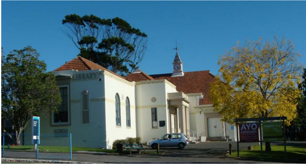
Grey Lynn Library